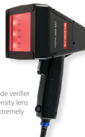
Omron's LVS-9585 handheld barcode verifier is equipped with a special high-density lens that can comprehensively verify extremely small codes and DPMs.