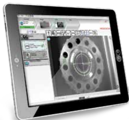
Omron MicroHAWK with weblink software for precision traceability and inspection solutions.

addressing specific challenges with advanced barcode reading, machine vision and DPM verification systems. Miniaturization, product longevity and ease of use are major themes in the design of new solutions for traceability in the medical industry.