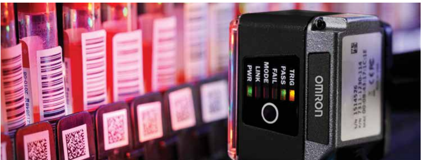
A MicroHAWK reads data from codes placed on test tubes.

Health Canada has similar regulations to the FDA UDI and GS1-Canada assists Medical Device Manufacturers with issuing UDIs which are used both in Canada and the US. GS1 has a Global Trade Identification Number (GTIN) which is a globally unique ID number which would allow a company to sell a product both in Canada and the US and keep the UDI information in both the FDA and the Health Canada databases.