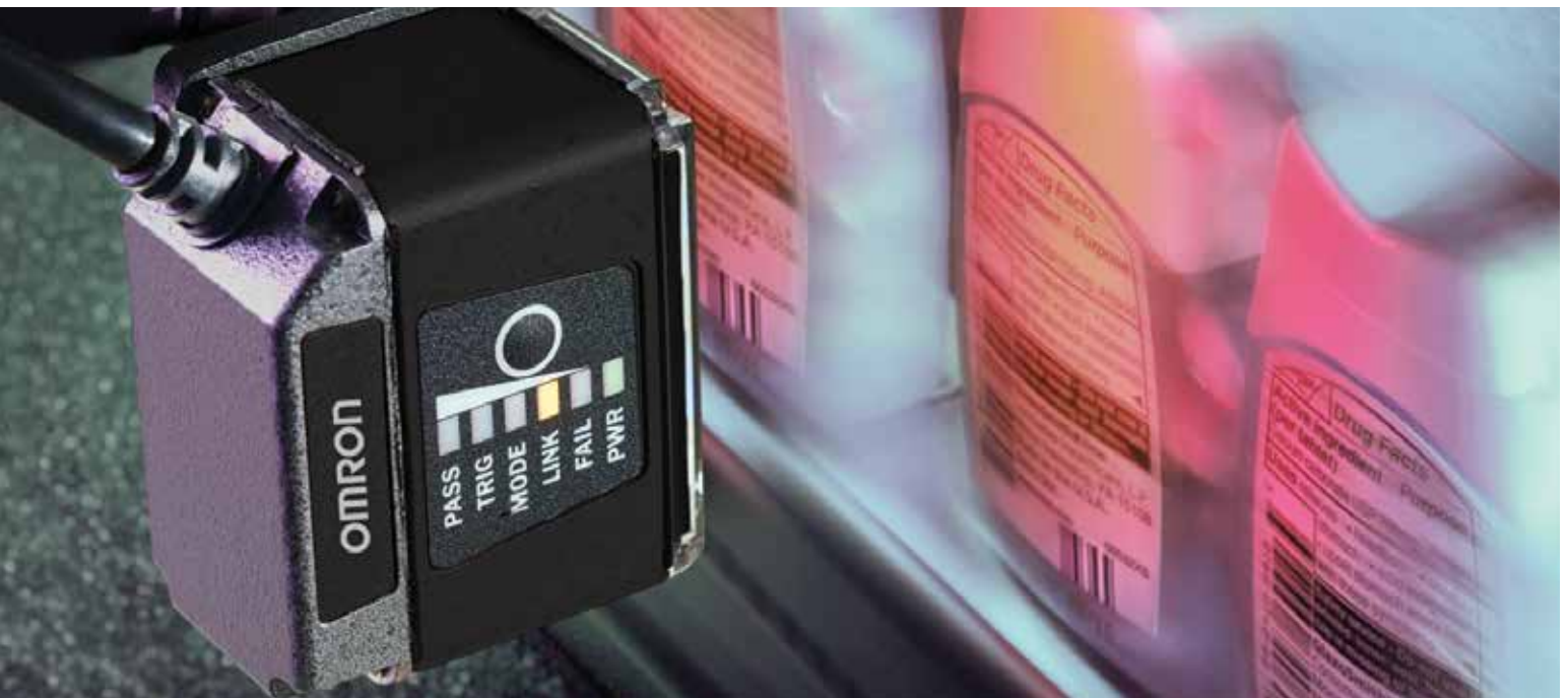
MicroHAWK industrial barcode readers are an integral part of Omron's overarching traceability solutions.

The MicroHAWK line is also incredibly easy to use. With the browser-based WebLink interface, these barcode readers read right out of the box with no software installation whatsoever. This "out-of-box experience" is a hallmark of an Omron solution, as Omron has even managed to make machine vision technologies such as its HAWK MV-4000 smart camera intuitive to the average user as well as to the expert.