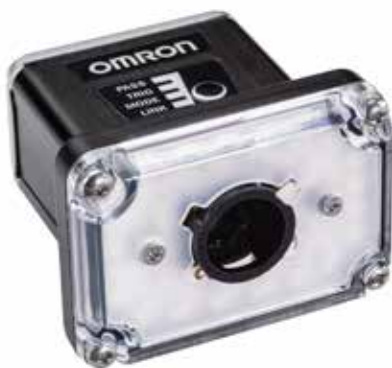
MicroHAWK V430 with ring light capable of capturing codes in all sorts of applications – including metal cavities – it is the scanner of choice for industrial traceability solutions.

In addition, the latest technologies are built to last longer than before, and longevity is essential when these products are built into complex sample analyzers. Omron focuses on maximizing product longevity as well as managing obsolescence with effective transition plans for OEM customers, thereby making overall clinical diagnostics solutions much more dependable.