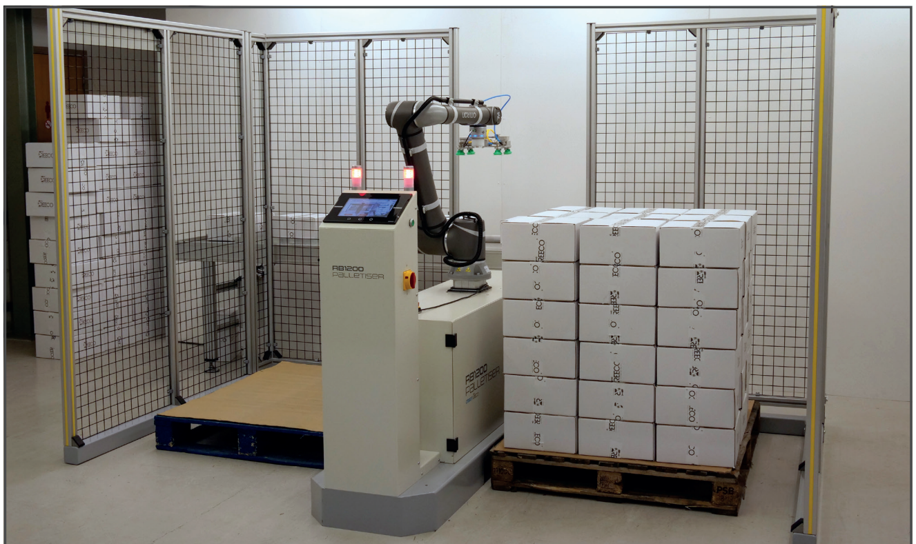
Measuring just 2.2 x 3.2m, the RB1200's footprint is 60% smaller than a typical 4x4m cartesian palletiser