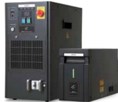
Omron's MX-Z laser marking machine produces durable, high-resolution symbols.

Omron's MX-Z family of laser markers offers the kind of high-quality, permanent part identification that industrial traceability demands. It marks a variety of materials, including stainless steel, iron, copper, gold, silver, aluminum and plastics, with the option to employ color marking on stainless steel. Its exceptionally high resolution of 2 \mu m allows it to mark characters as small as 0.1mm (100 \mu m). It also provides the benefit of connectivity and integrates easily with other systems and controls.