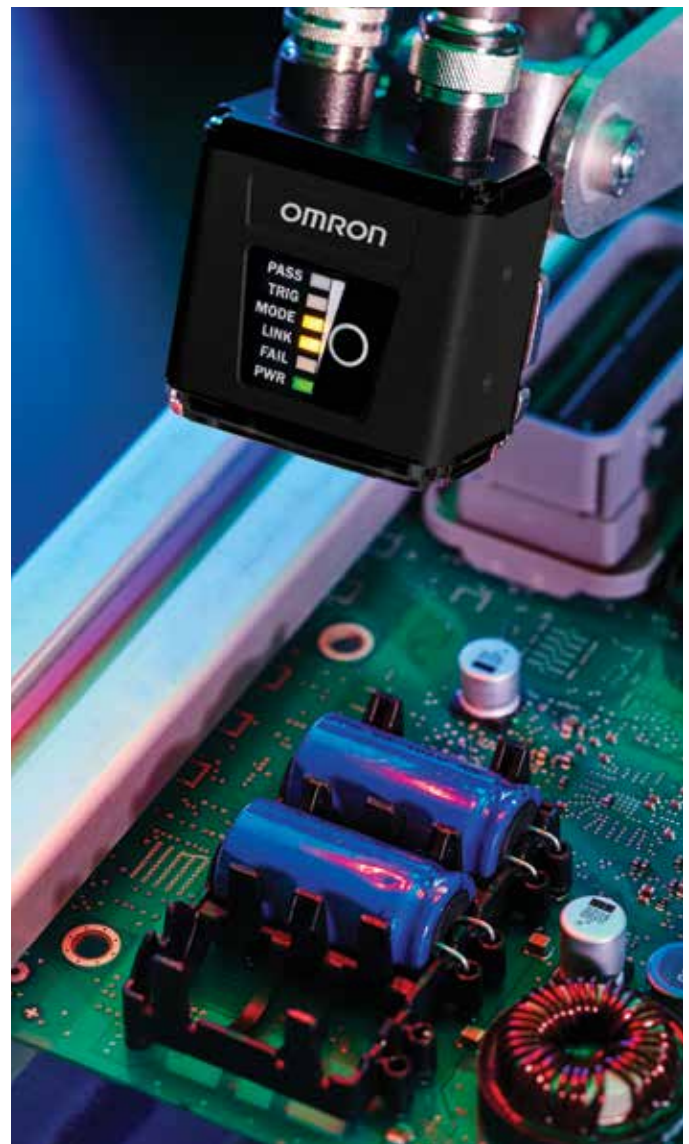
MicroHAWK industrial barcode readers are an integral part of Omron’s comprehensive traceability solutions.

Another challenge in part marking is the fact that many parts – such as those in consumer electronics manufacturing – don’t provide much room for adding barcodes. Manufacturers need to find ways to make DPMs smaller and sometimes even place them on surfaces that aren’t completely flat.