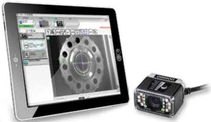
Omron MicroHAWK with WebLink software for precision traceability and inspection solutions.

them. There are plenty of traceability-related issues that are beyond the scope of this white paper, but no matter the challenge, it could most likely be assigned to a particular part of MVRC and be more easily understood.