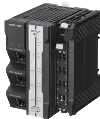
Omron’s NX1 controller is designed to ensure that a traceability system can collect large amounts of data without slowing down the production cycle.