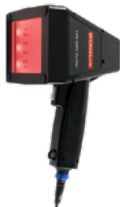
Omron's LVS-9585 handheld barcode verifier is equipped with a high-density lens that can verify extremely small codes and DPMs.

Production materials often place a limit on the grade that a DPM can achieve. For example, slight changes in the color of a printed circuit board