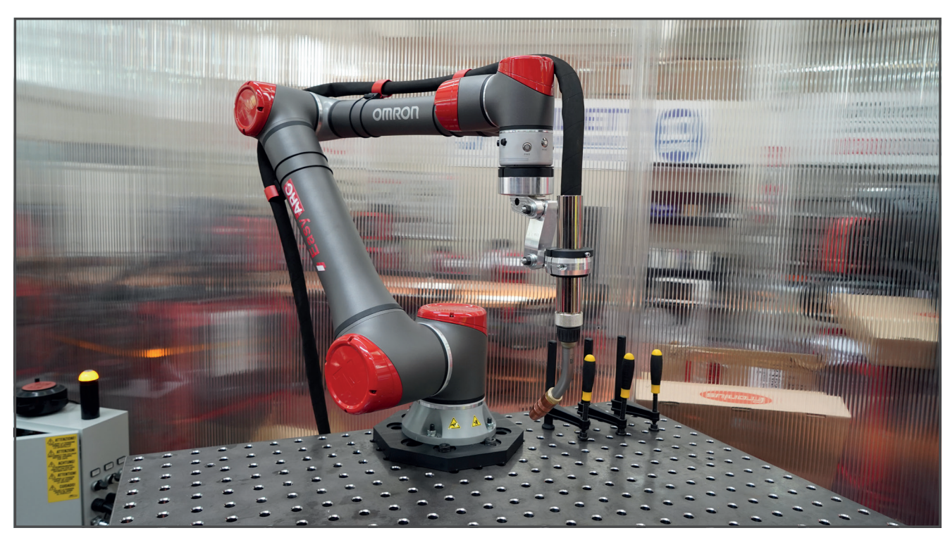
A complete interface integrates the management of all of the processes with the cobot controller.

A complete interface integrates the management of all of the processes with the cobot controller. The aim is to help expert welders with repetitive work, without any special programming skills being needed. This frees them up to spend their time and energy on more difficult and demanding work. The welder can manually set a sequence of points for the trajectory to be executed and refine this with minimal instructions on the programming panel.