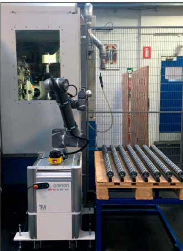
Fischer Gears invested in two Omron TM cobots to automate the feeding of metal parts into four CNC machines.

Fischer Gears produces their products with series sizes that can vary from one item to several hundred pieces. The investment in Omron's cobots will enable the company to become much more competitive in the future with these larger orders.