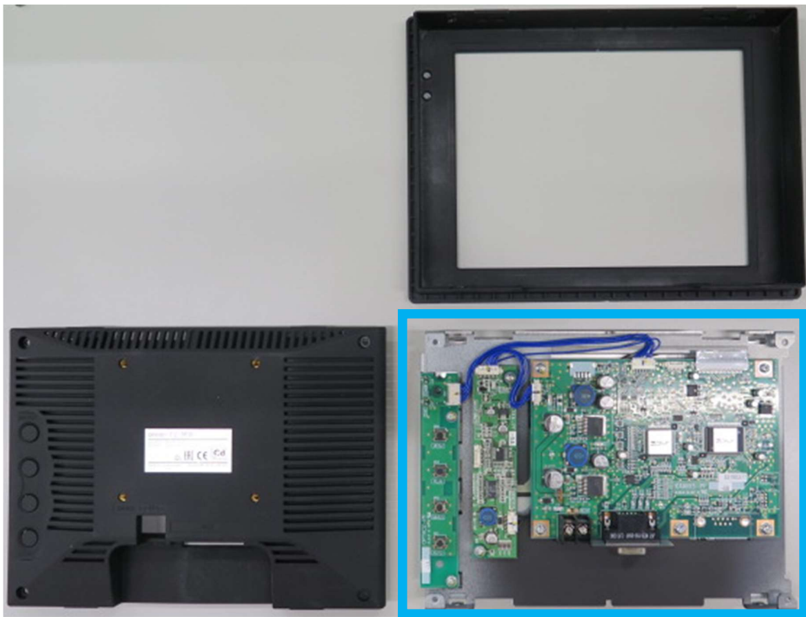
Disassembly Drawing A

This product contains printed circuit boards , LCD screen and battery which are recommended to be treated separately during the End of Life operations.