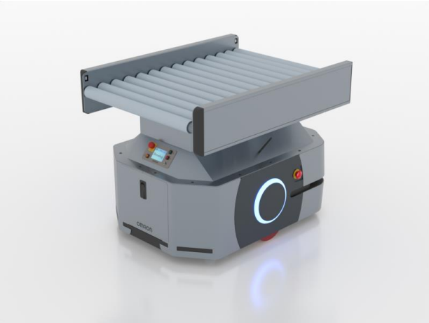
Roller Conveyor LD-250-RC-LW-5

Sturdy and customizable lengthwise roller conveyor for the LD-250 mobile robots. All models have silent and high friction coated rollers as standard, as well as optical sensor at the front of the conveyor to identify the transported products. The height of the conveyor level from the floor can be selected when ordering from 500 mm to 1100 mm. A wide range of accessories available, for example additional sensors, electric stoppers and electric height adjustment.