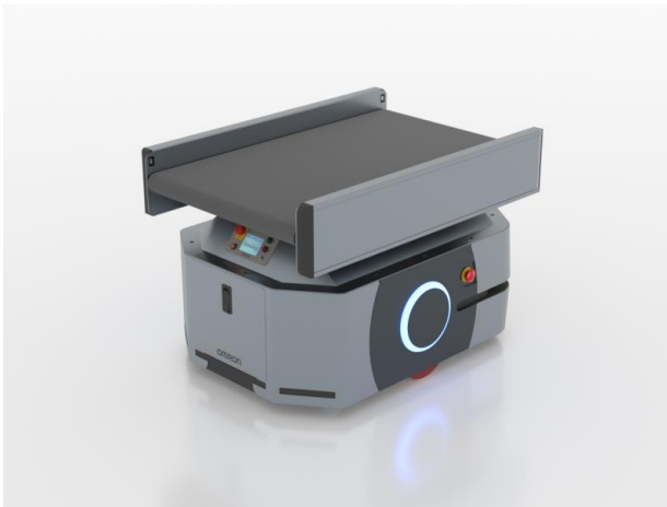
Belt Conveyor LD-250-BC-LW-4

Sturdy and customizable lengthwise belt conveyor for the LD-250 mobile robots. All models have silent and high friction belt as standard, as well as optical sensor at the front of the conveyor to identify the transported products. The height of the conveyor level from the floor can be selected when ordering from 500 mm to 1100 mm. A wide range of accessories available, for example additional sensors, electric stoppers and electric height adjustment.