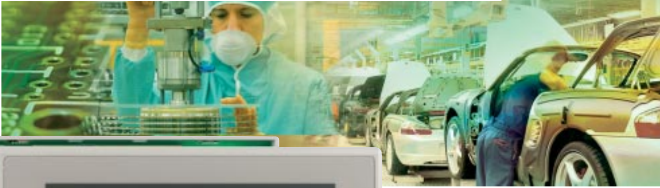
Advanced Industrial Automation

The NSJ5 is all you need to build your automation solution. This OMRON product is the next step in panel-less automation created for applications that require visualisation, control and open network connection with little space!