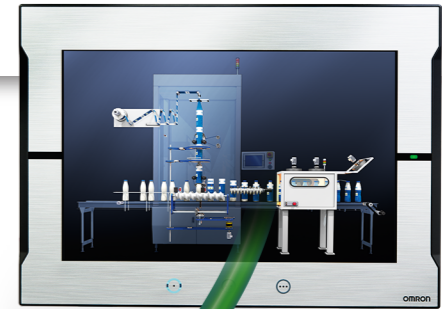
HMI NA series

Distributing I/Os and networked devices over the single EtherNet/IP Machine network simplifies wiring and development time by as much as 30%.