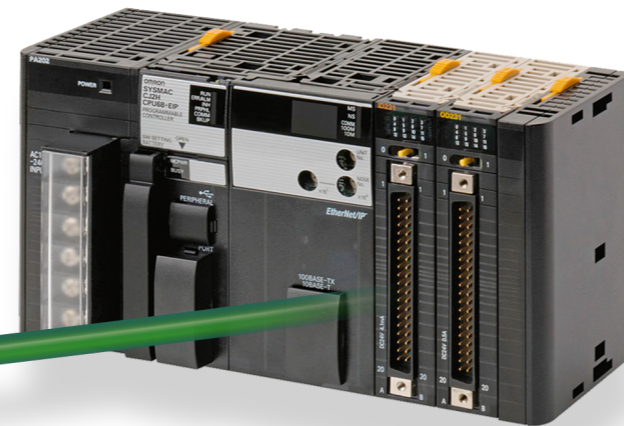
PLC CJ2 controller

Easy access to all device data and settings via the HMI and PLC connections help ensure that your service engineers stay informed at all times and can take action the moment it is needed. The result? More production, less downtime.